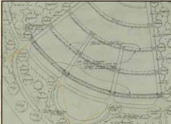
Pastorious Park Revising Planting Plan ~ 1935