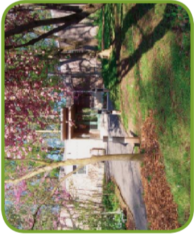
Pennypack Environmental Center is handicapped-accessible.

Pennypack Environmental Center 8600A Verree Road Philadelphia, Pennsylvania 19115 215-685-0470